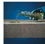
Acid resistant / chemical resistant