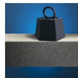
High compressive strength